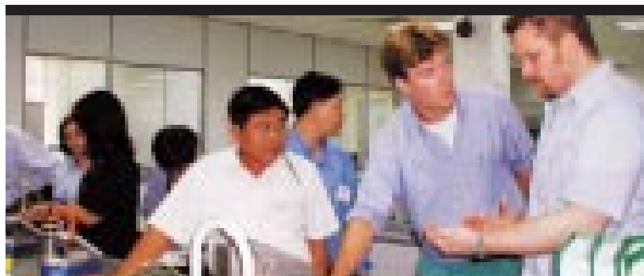
Effective learning through hands-on training